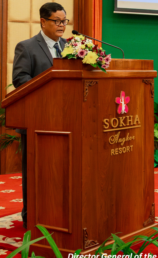
H.E. Thong Sokun Director General of the General Department of Environment and Infrastructure Affairs of the Council of Ministers